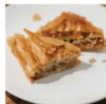
ASSORTED BAKED GOODS