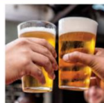
INTERNATIONAL BEER & WINE