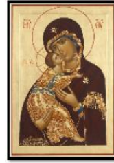
Theotokos of Vladimir

EASTERN ORTHODOX WOMEN'S GUILD OF GREATER CLEVELAND