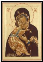
Theotokos of Vladimir