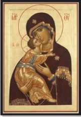
Theotokos of Vladimir