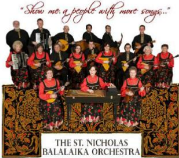
THE ST. NICHOLAS BALALAIKA ORCHESTRA A FOLK ORCHESTRA FROM MOGADORE, OHIO

Whether you're a professional, amateur, or simply love music, come meet us at a rehearsal!